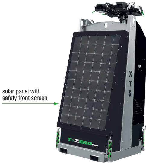
solar panel with safety front screen