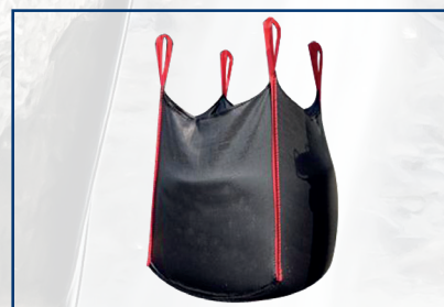
Big Bag Geo-Textile fabric 190 gr/sqm