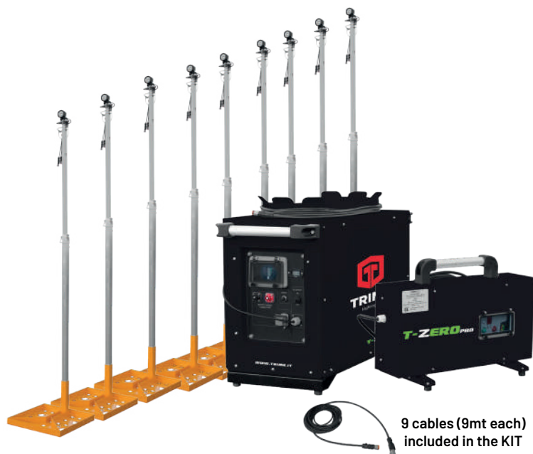
9 cables (9mt each) included in the KIT